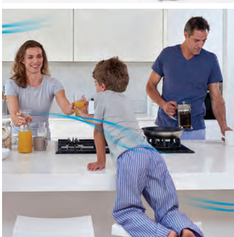
Skylights, Ventilation – Roof, Room and Whole House